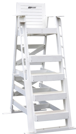
Sentry® 66" seat height lifeguard chair