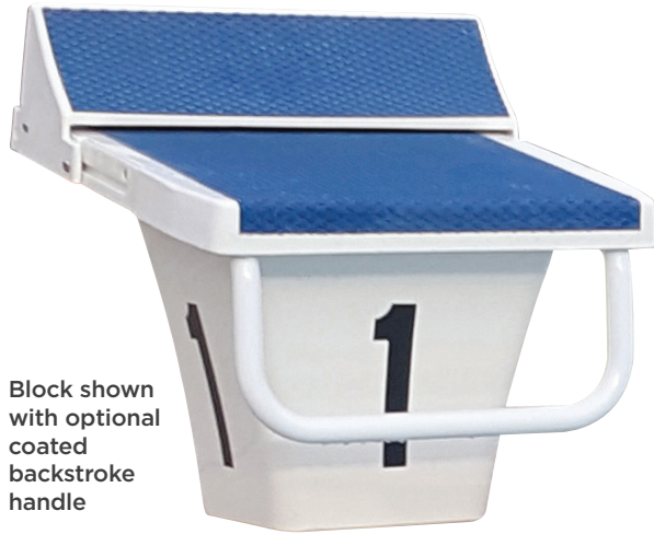
Block shown with optional coated backstroke handle