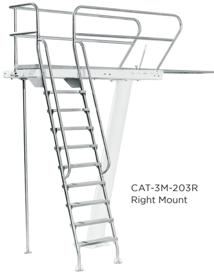
CAT-3M-203R Right Mount